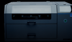
PRETREATmaker max 5